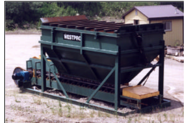
HF35 with Varispeed Electric Feeder