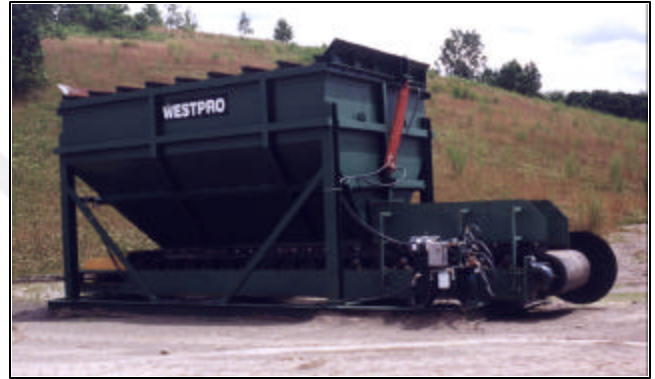
HF35 Hopper / Feeder