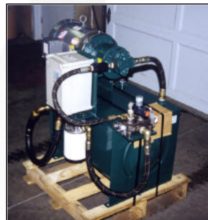
Hydraulic System for Grizzly Lift