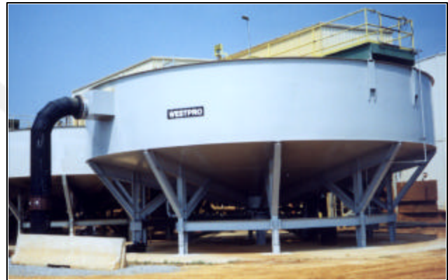
Model TH45HC 45' High Capacity