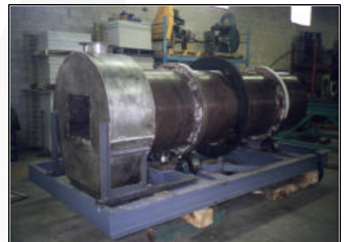
3' Diameter x 10' Long Agglomerator