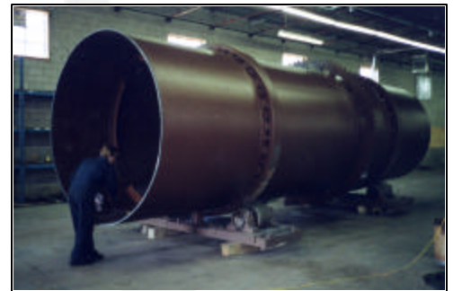
Heavy Duty Drum & Riding Ring Construction