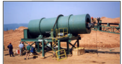
Modular Frame for Quick Installation