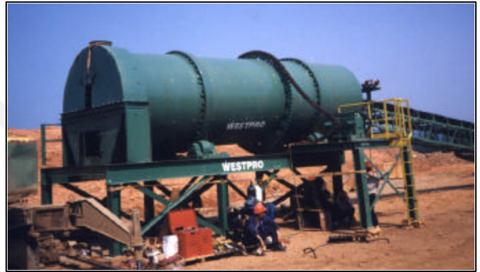
8' Diameter x 30' Long Agglomerator